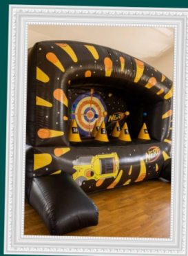
Nerf Target Range